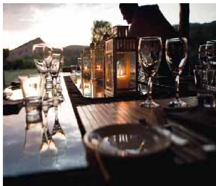
Clockwise from above: South Australia is world-renowned for its wines; The Louise in the Barossa Valley offers scenic hiking; The eco-smart fireplace at Kangaroo Island's Southern Ocean Lodge; Arkaba Station in the Flinders Ranges serves drinks alfresco.

Discover regional riches and the redefinition of luxury at South Australia's indulgent lodges.